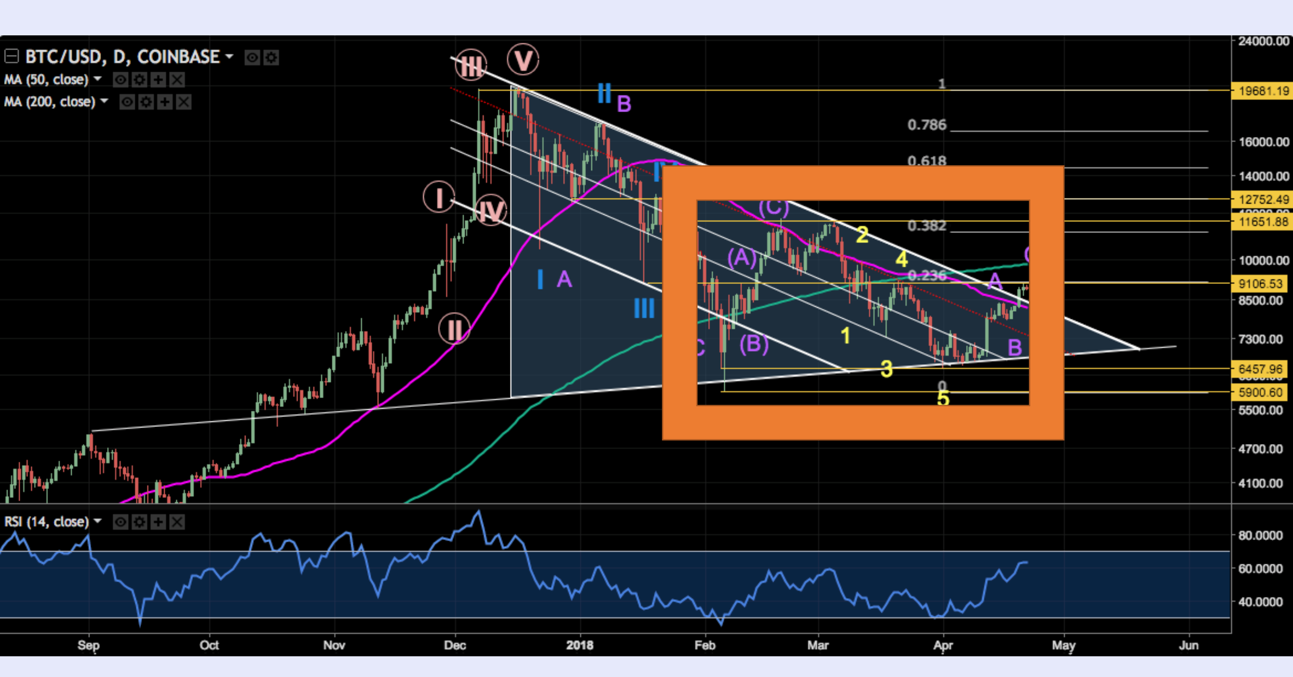
Basic / Advanced Technical analysis tools – Long term analysis