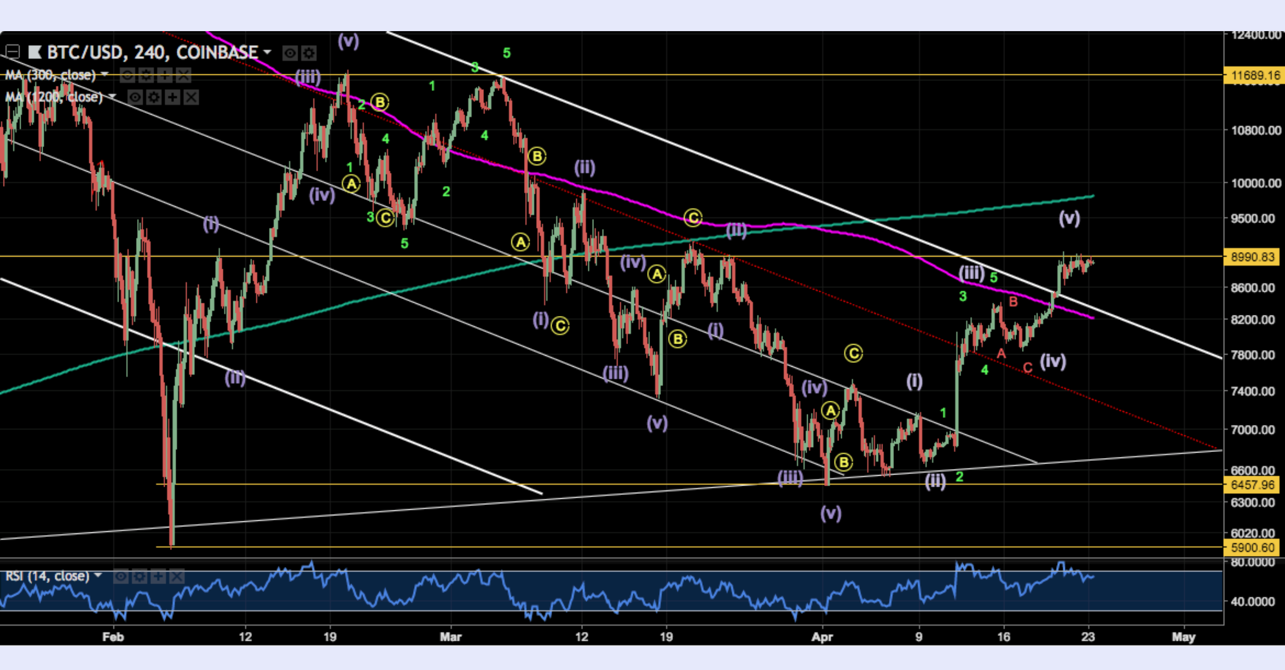
Basic / Advanced Technical analysis tools – Short term analysis