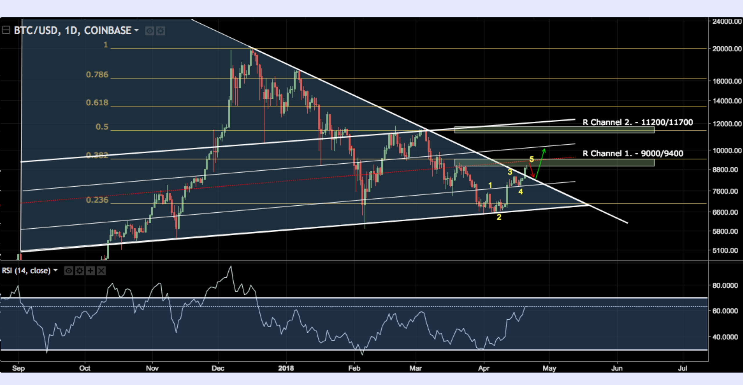
Bitcoin down move 2014 compared to 2018